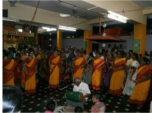
Pithapuram women performing traditional dance